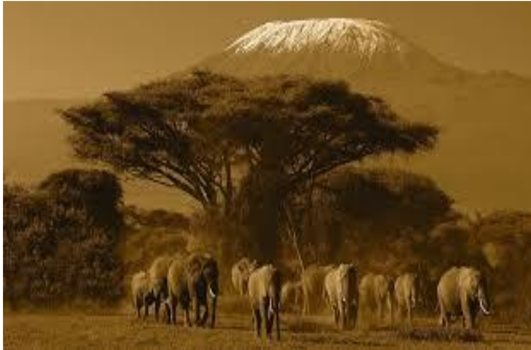
Elephants in the Kilimanjaro Heartland