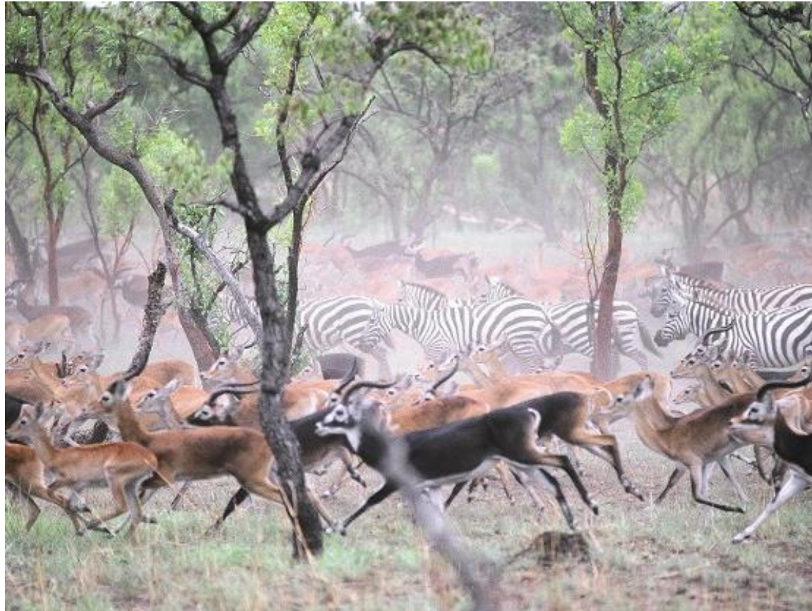
Migrating white eared kob in South Sudan