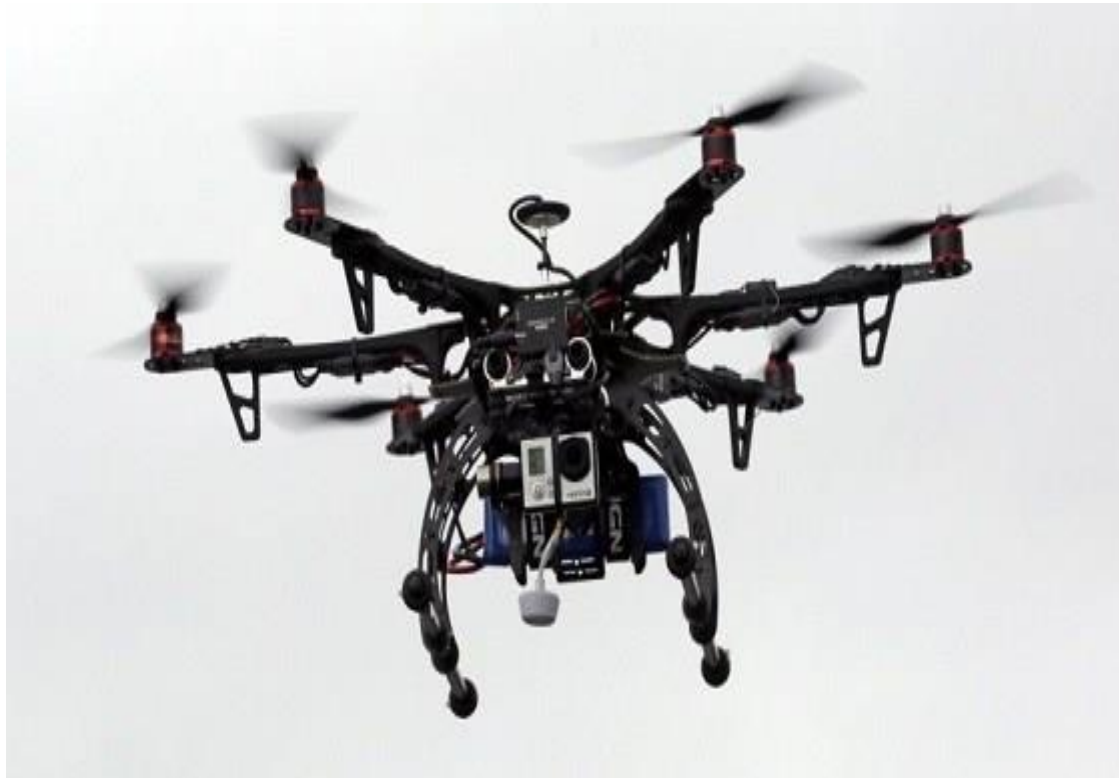
A drone used in anti-poaching operations