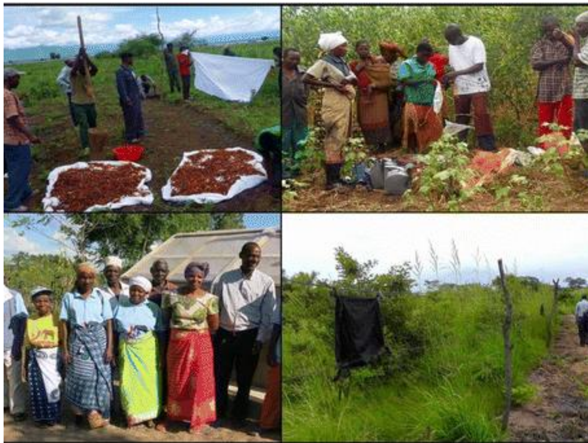
Chili pepper fencing