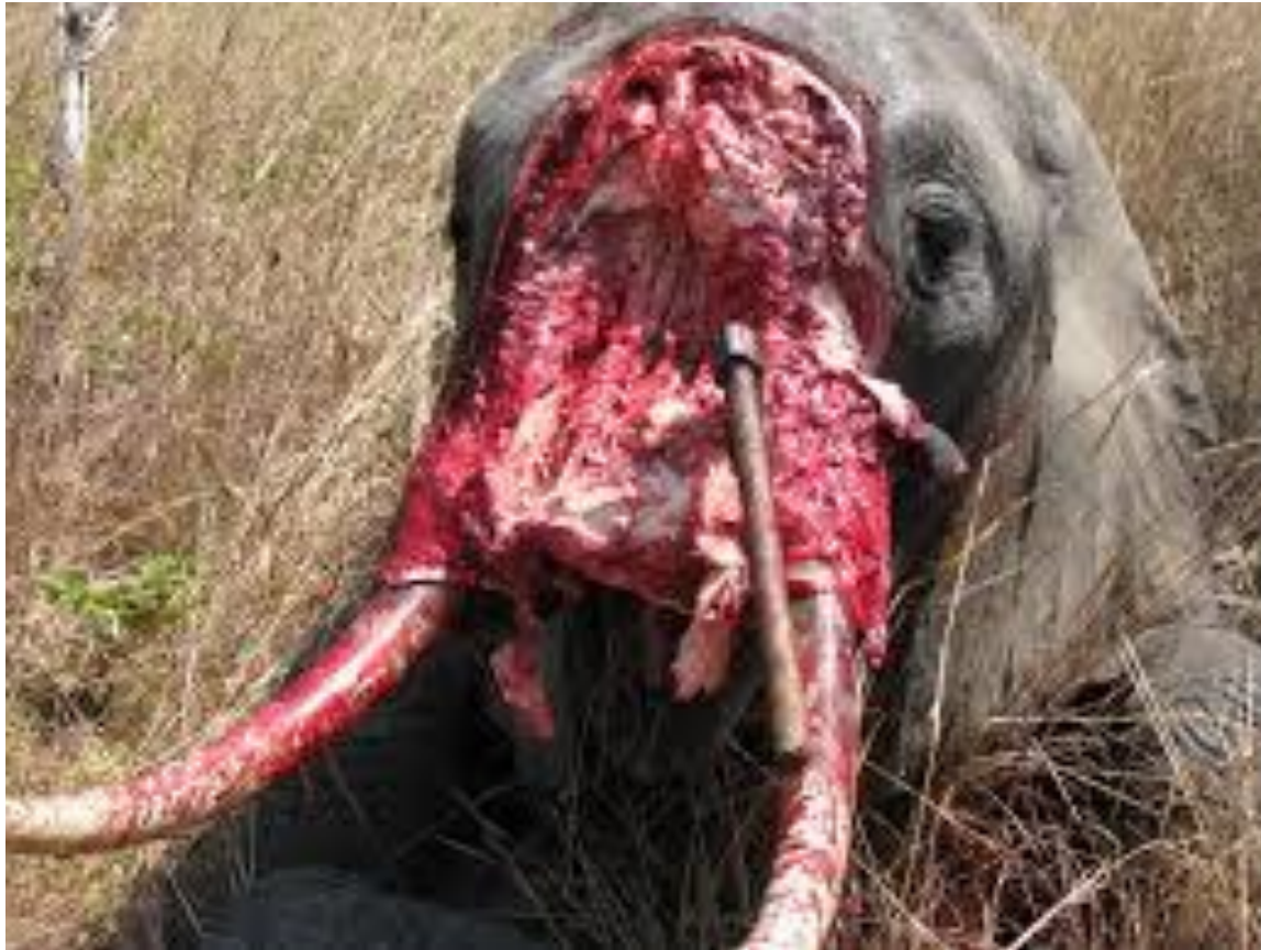
Freshly killed elephant carcass with tusks being removed