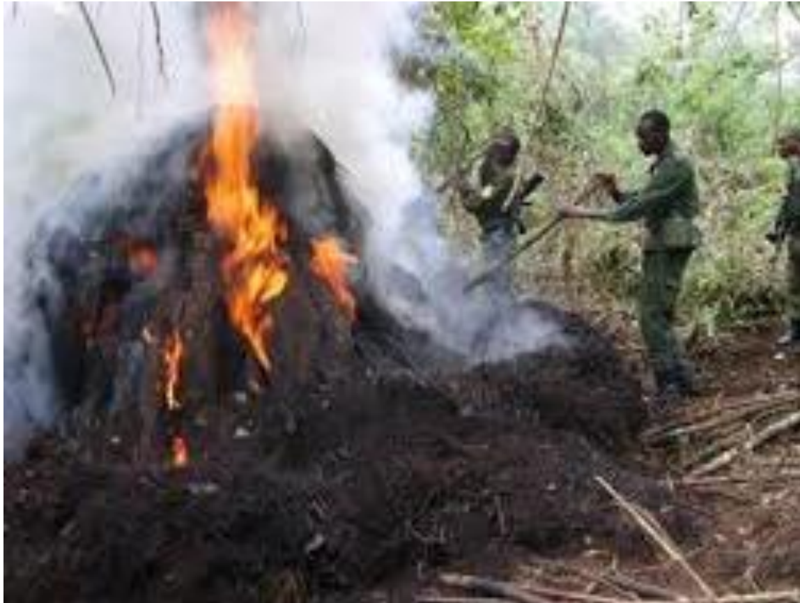
Slash and burn