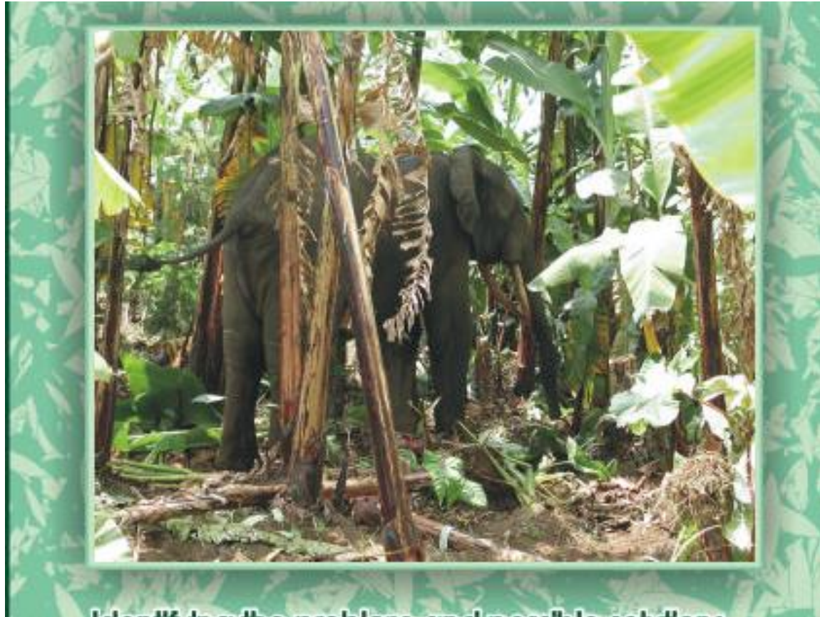
Elephant in banana farm