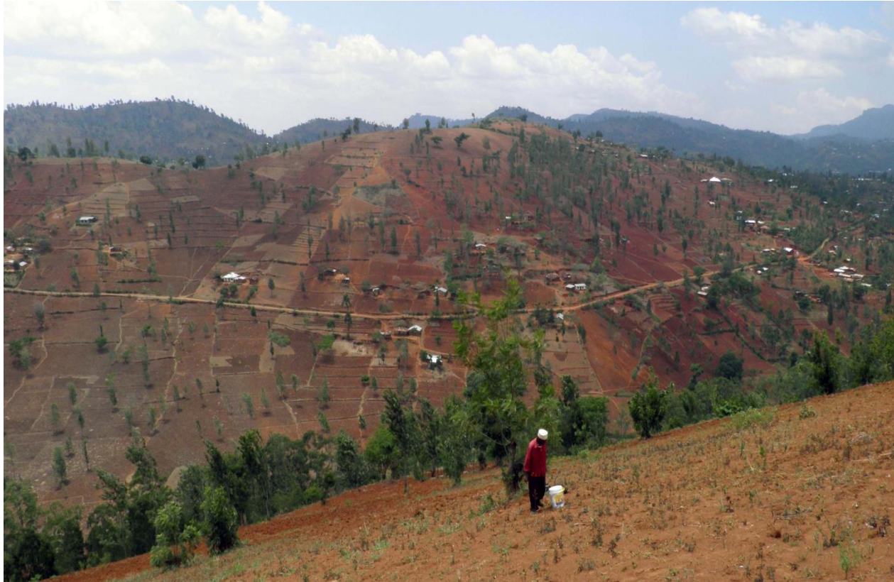
Encroachment of cultivation in the Usambara mountains