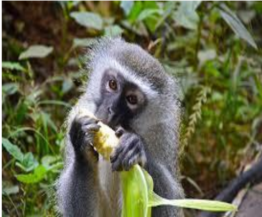
Monkey raiding maize