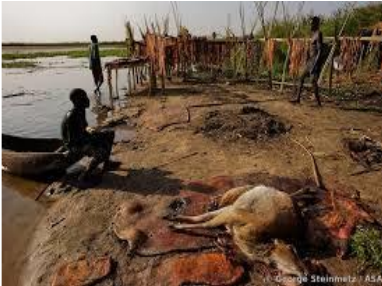
White eared kob carcasses killed for bushmeat in South Sudan