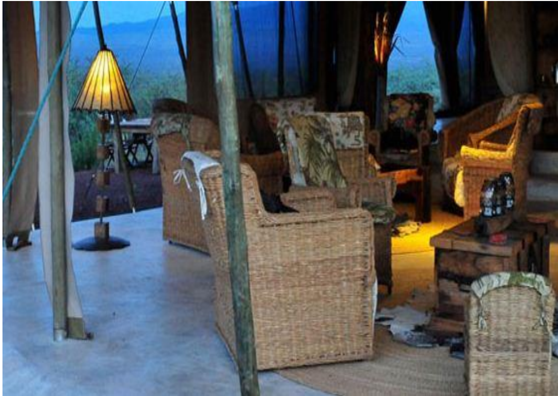
Luxury tented camp in Enduimet WMA