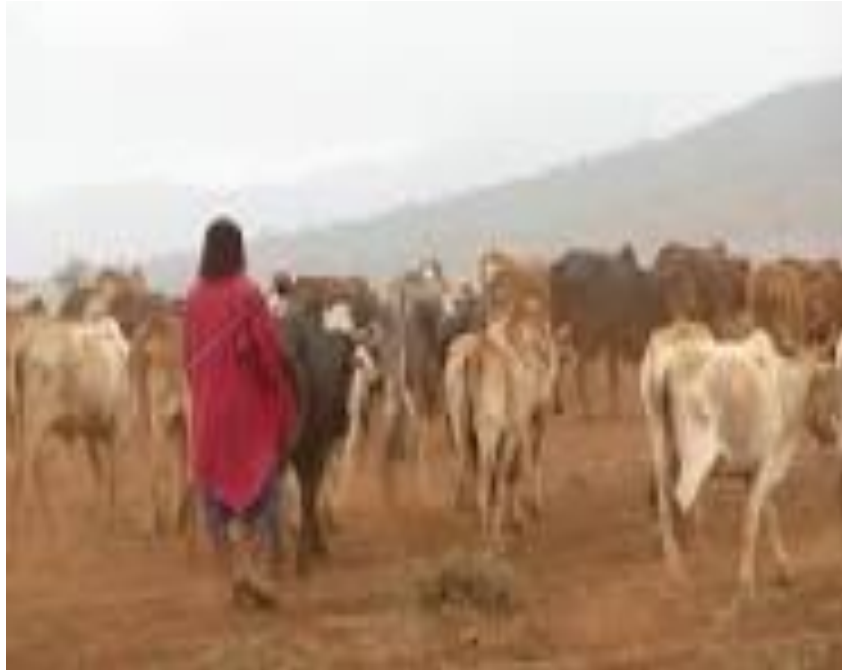
Masai with their cattle in Simanjiro