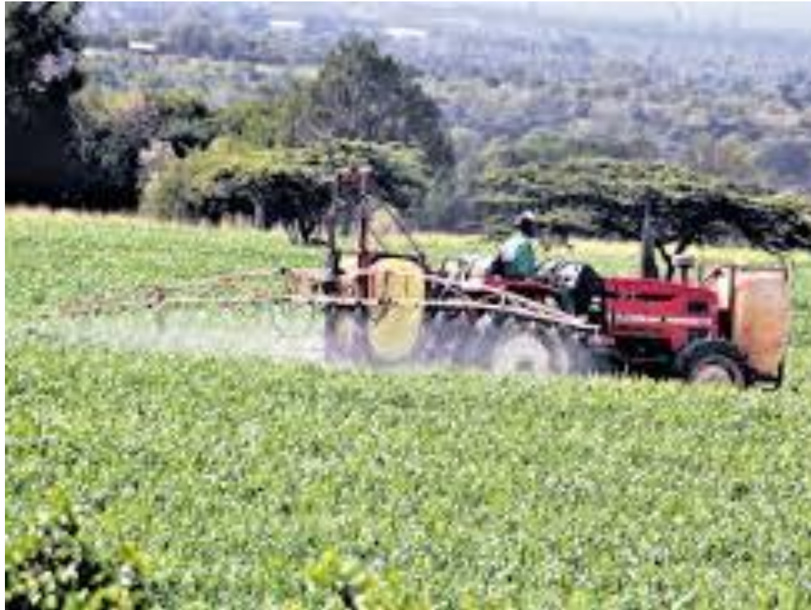
Large scale farming in Laikipia