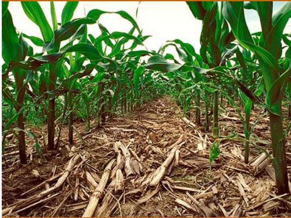
Conservation farming of maize