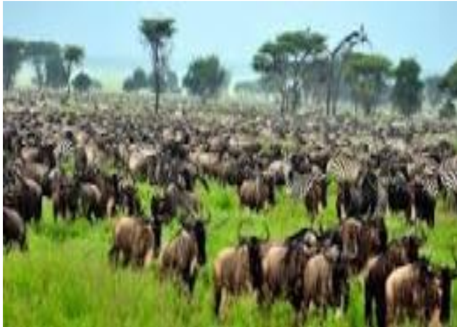
Wildebeest in Simanjiro